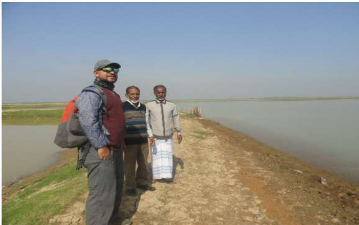
Image-10: External Expert Conducting Feasibility study for ecotourism

Feasibility study for ecotourism development in the piloting area has been completed. An external expert has conducted the survey and identified the opportunity of promoting ecotourism in the piloted area. A detailed report on the feasibility study is provided in Annex 8.