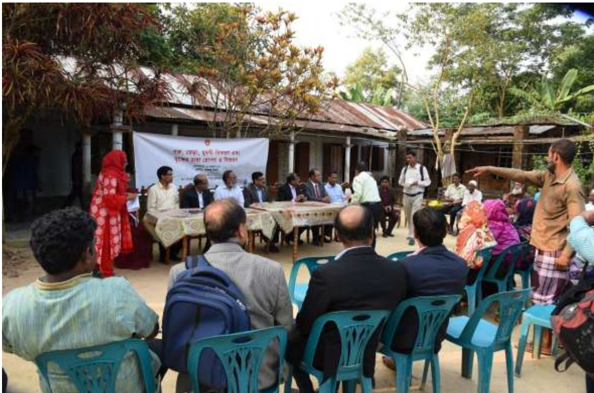
Image-2: Meeting with the VCG members and Sheep and Chicken Distribution